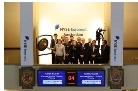
Winner Traders Trophy closing the Amsterdam Exchange