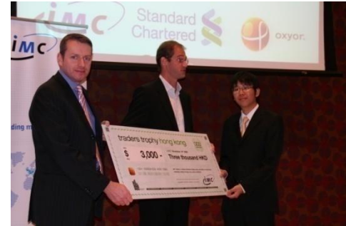
Winner Hong Kong Final