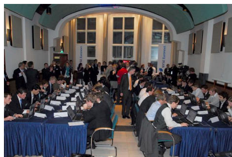
Final at NYSE Euronext Amsterdam