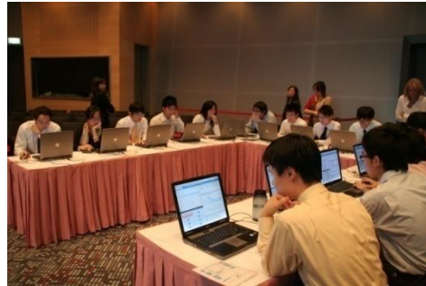
Final at Hong Kong Exchange