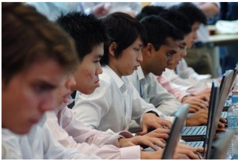
Action at Singapore Final