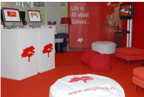
Sponsor lounge at qualifying rounds