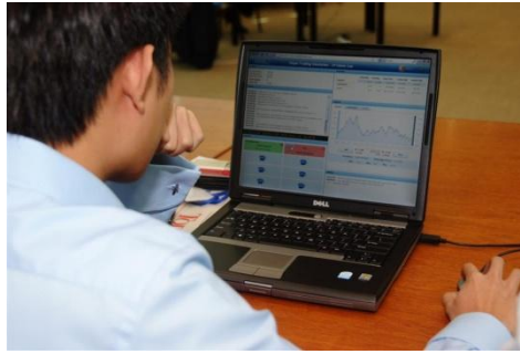
Screen shot of trading simulation