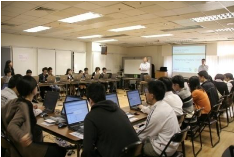
Qualifying round at HKU